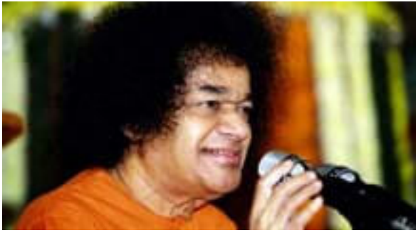
Sathya Sai Baba

“Study the lives of our great women, who were models of patience, fortitude, compassion and sacrifice. I desire that you should take up the reins of leadership and bring peace and prosperity to the nation by leading ideal lives.”