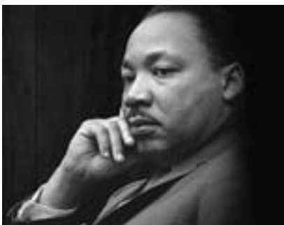
Martin Luther King

"Love is the only force capable of transforming an enemy into friend."