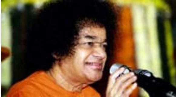
Sathya Sai Baba

"Love All Serve All" - "Help Ever Hurt Never"