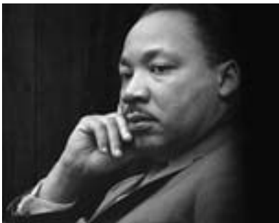
Martin Luther King

"Freedom is never voluntarily given by the oppressor; it must be demanded by the Oppressed. "